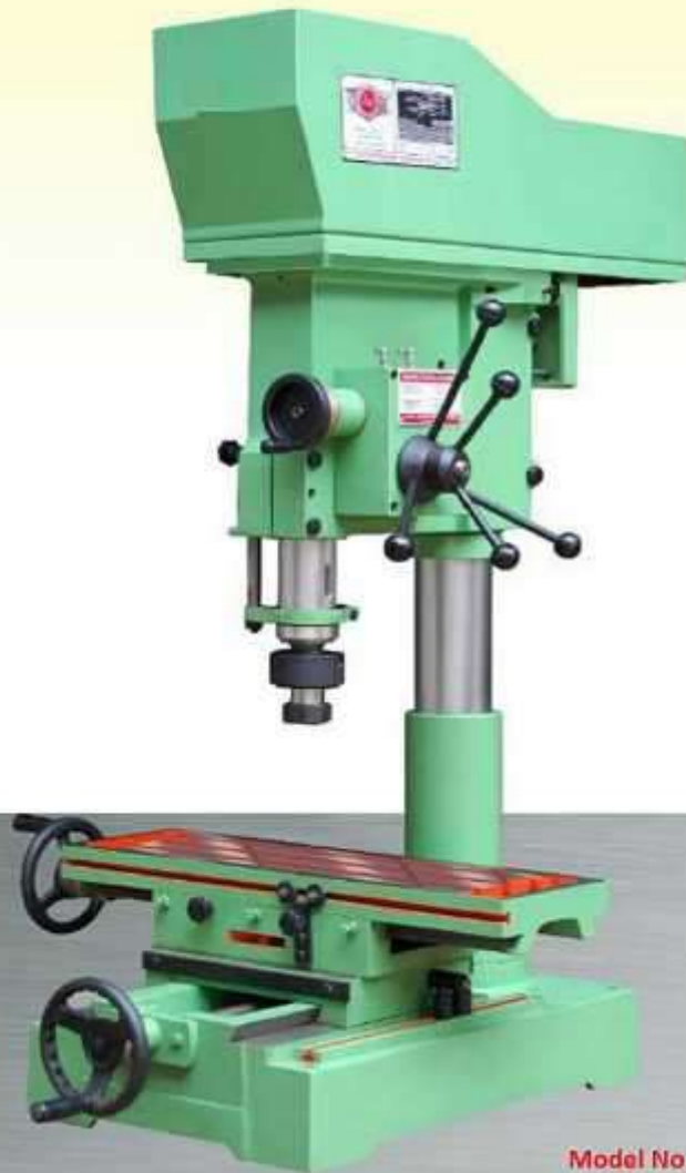
Model No. FMD-38