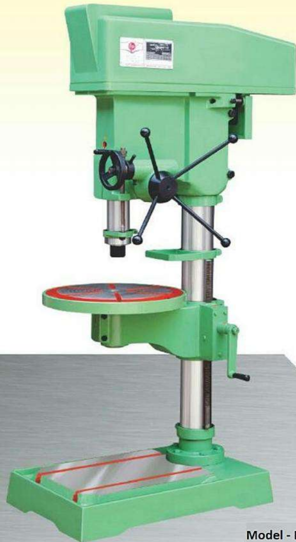
Model - FP-40

Fitted 'C' Section V-Belt Pulley for Extra Heavy Load